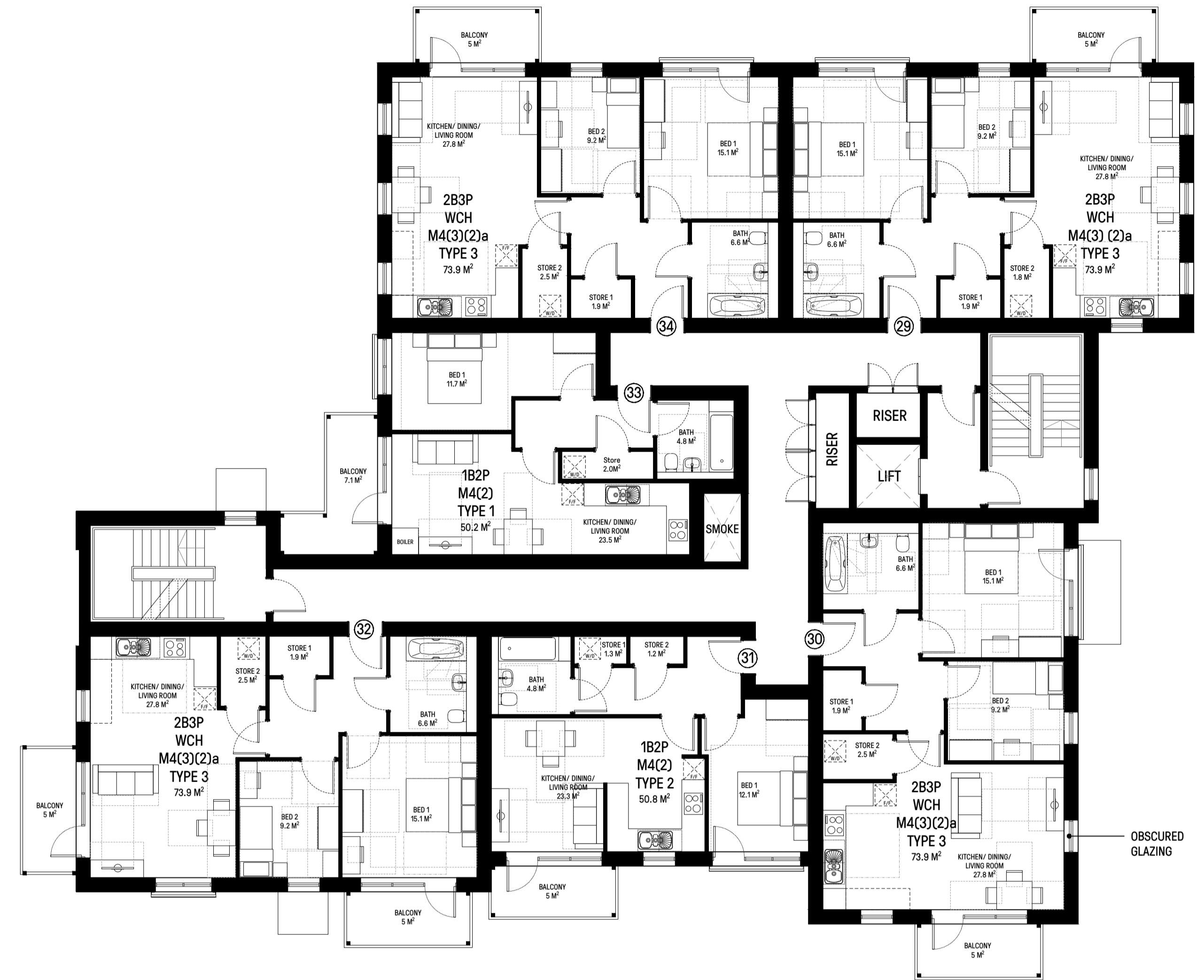
2 FIRST FLOOR 1:100